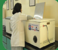
CENTRAL INSTRUMENTATION FACILITIES