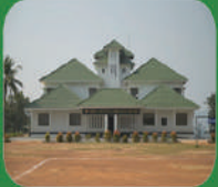
LIBRARY & RESEARCH CENTRE