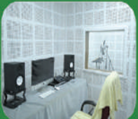
AUDIO VISUAL LAB