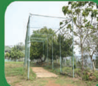
CRICKET PRACTICE NET