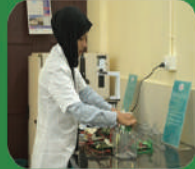
HIGH END LABORATORIES